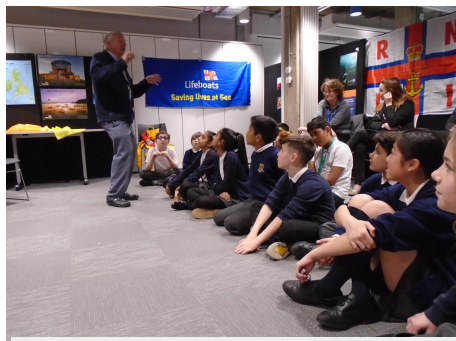
Keeping safe in water with RNLI