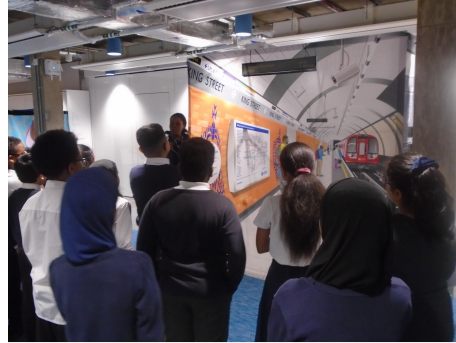
Travelling safely on the Tube with TfL

Overall the experience was hugely beneficial for all the children who were buzzing with the knowledge they had gained during the walk back to school.