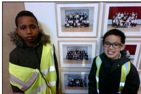
Pupils with the HPS photos in the Duveen gallery

There were thousands of photos displayed in the beautiful Duveen gallery.