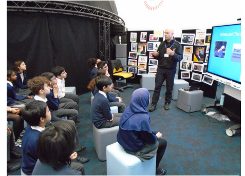
Learning how to combat knife crime with the Metropolitan Police