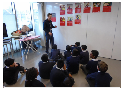
Fire safety with London Fire Brigade

They left Brunel University with a smile on their faces and ready to be good citizens within the community.