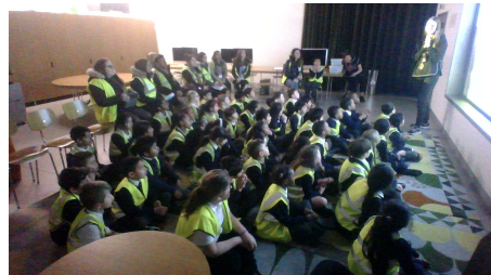
Listening to Steve McQueen's video message

The children traveled by coach and had a guided tour of the Tate by the gallery staff. We were not lucky enough to meet Steve McQueen, but we watched a video message from him before going to find our class photos.