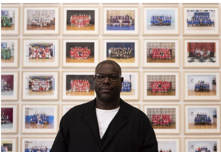
Award winning artist Steve McQueen with some of the class photos.

When the children were in Year 3, they were fortunate to be part of a large art project by artist Steve McQueen, simply named 'Steve McQueen Year 3.' Steve McQueen is a Turner prize winning artist and Oscar winning film maker.