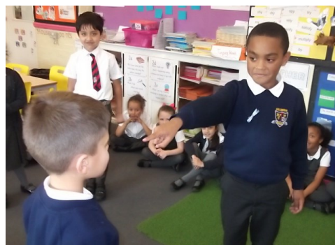
Year 2 Anti-bullying drama work

and discussed how, although they might like different things, they are all equal and their likes or dislikes are still valued. The boys and girls in Year 1 and 2 have learnt about the different houses in the local area and the varied views from their windows.