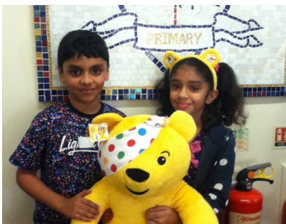
Our Children-in-Need Merchandise Sale Raffle Winners