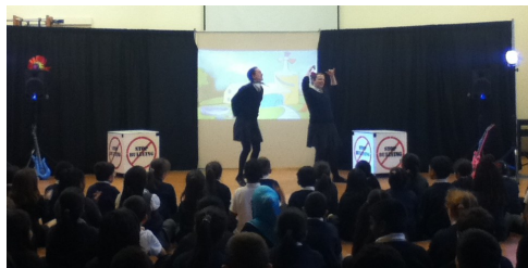
Anti-bullying Workshop 'Ugly'

This year's Anti-bullying Week's theme was 'All Different, All Equal'. At Hillingdon Primary School the boys and girls have celebrated what makes them unique through a variety of activities including Circle time, Geography tasks and, in years 3, 4, 5 and 6, evaluative class discussions about the show 'Ugly' presented by the company 'One Day'.