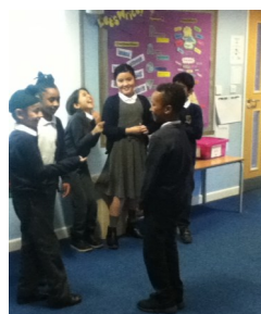
Year 5 Drama based on Pixar's 'For the Birds.'

We say tell your troubles straight away!