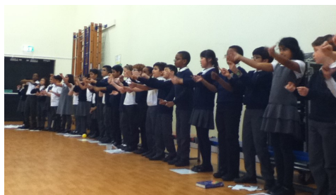
Year 4 Anti-Bullying Assembly

The week was launched by 4D's superb class assembly. Thank you for your clear messages and wonderful speaking!