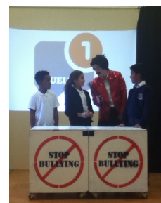
Anti-bullying Workshop 'Ugly'