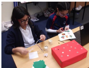
Creating the games

designing the boxes; moulding the wire; creating a background and, most importantly, creating the circuit.