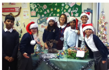
Year 4 Christmas Tree Decorations