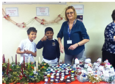
Year 3 Christmas Table Decorations