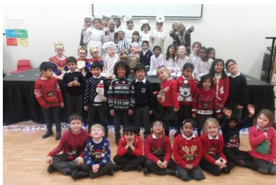
Our Fabulous Performers

What a marvelous way to finish off the last Friday of term with the Nativity shows from 1C, 1D and 1O!