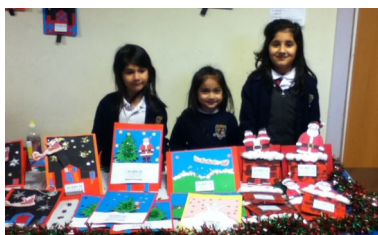
Year 1 Calendars