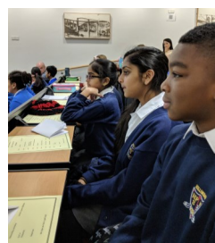
Listening and learning from others in the lecture hall

Brunel University then provided each child with a lunch voucher worth £6. The children were tasked to visit the university cafeteria and apply their mental maths skills to select a lunch that fell within the £6 limit.