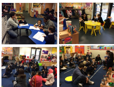
Reception's Read, Write, Inc. Lesson

For Reception's first Shared Learning session we focused on phonics. We took the children, and parents, through a typical Read Write Inc lesson.