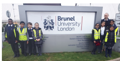
Our Digital Leaders arrive at Brunel