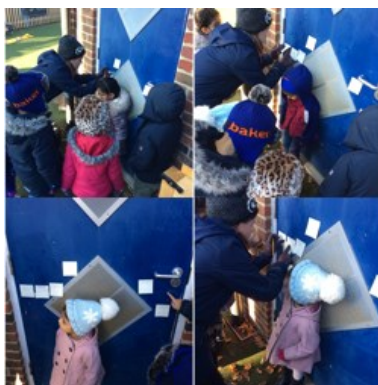
Who's the tallest?

Other children wanted to measure their heights so parents supported