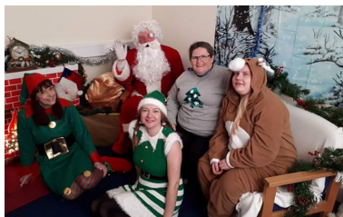
Santa and helpers

We were also fortunate to be visited by Santa Claus and Mrs Claus who, ably supported by our very own elves, got to meet many of our children: we're sure that they are all on Santa's 'good,' list.