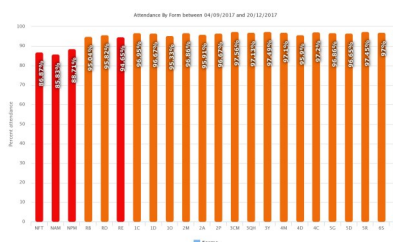
Attendance by Class - Autumn Term 2017

Please speak to our Welfare Team about the ways we can support your child to get back to school if he / she feels slightly under the weather.