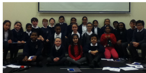
H Factor Finalists and our wonderful Readers

join us at school instead and the atmosphere in the hall was incredible: everyone sung their heart out!