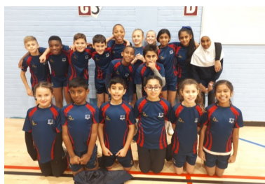
Sportshall Athletics Champions!

Our children behaved fantastically and showed great