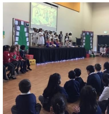
Year 1 in Action