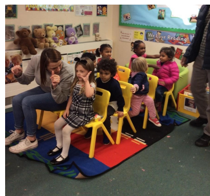
Nursery singing 'Wheels on the Bus' as they travelled around London

In the afternoon, children in the nursery showed how learning through play could be enjoyable and purposeful to all the participants. Children involved a mum in making a bus and looked for objects in the nursery that they could use as props. They worked as a team when counting how many seats they needed on the bus and used their imagination to travel around London.