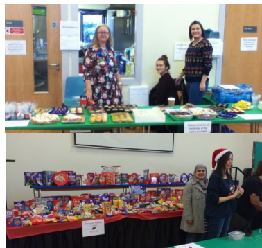
Fabulous helpers on the refreshments and chocolate tombola stalls