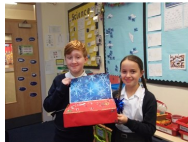
The finished product!

It was great to see them using their science skills to form a circuit in a practical way. Finally, the buzzer games were completed and were used to raise lots of money at the Christmas Fayre.