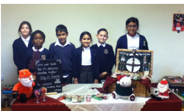
Year 5's Yummy Truffle Stall

We are thrilled to report that altogether the Fayre raised approximately £2,200 (net surplus) for the school. This much appreciated additional income will be used for extra curricular activities arranged during the school day to enhance our children's education.