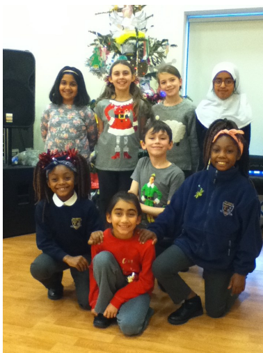
Our proud peer mentors and play leaders

They have taken on roles such as peer mentors and play leaders. It has been wonderful to see them developing their independence, commitment and responsibilities and we know that many are keen to continue during the Spring term.