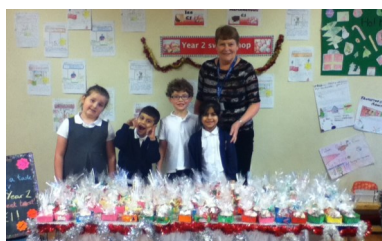
Year 2's successful sweet shop

The children created some amazing items and class stalls were beautifully decorated. Most stalls had almost sold out by the end of the Fayre! Special congratulations must go to Year 2 who had the most successful stall, generating a whopping £193 net profit!