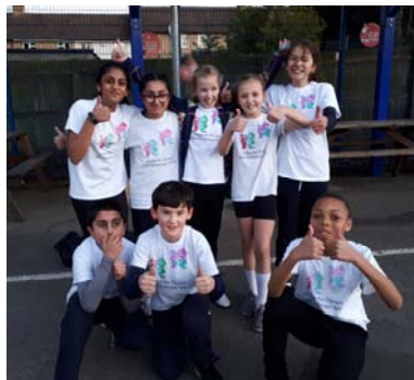
Netball Team Spirit!

What a few weeks for the Netball team....! The children have continued their success from before Christmas and have entered the New Year with a BANG! The team have grown in confidence and have shown wonderful team spirit as they challenged and defeated each of their opponents.