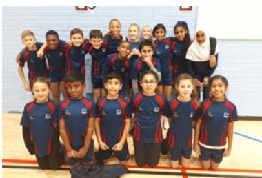
Our Sportshall Athletics Stars

Last week saw the culmination of weeks of hard work and training, as our Athletics superstars travelled to Vyners School to take part in the Borough Final. A huge number of schools battled for one of the places in the Final and on Wednesday, 18 HPS children proudly put on the school kit and took their place against the other 4 finalists.