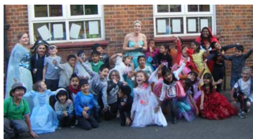
2M all dressed up as their favourite characters

Key Stage 1 also celebrated this special occasion by dressing up as their favourite Fairy Tale characters.