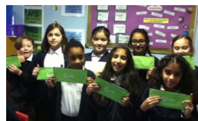
A few of our Year 5 Competition Winners

Special thanks to the Goethe Institut, London, who organised the competition.