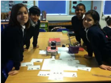
Team Work in Year 5

To kick off an exciting new term and new year, Hillingdon Primary held its Christmas-themed RE week during the first week back after the Christmas holiday.