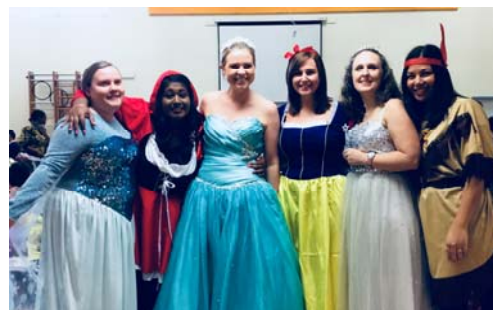
A few of our Fairy Tale Visitors!

To top the week off, whilst our fairy tale characters were enjoying their Disney-inspired lunch, they were visited by more characters from their favourite stories to help make the children's experience extra special.