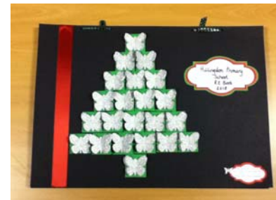
Our RE Book

A very exciting compilation book has been created, with each year group showcasing their fabulous learning through writing, art and photos. This special book will be making its way to St John's Church very soon, so please pop down and take a look at our wonderful achievements!