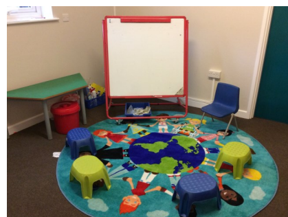
And after. What a difference!

activities during Shared Learning sessions. The children are benefiting from a calm and small environment, helping them to develop their concentration and focus on an activity. The opening of the room has also improved the home time period, when children are waiting for their parents to come and pick them up.