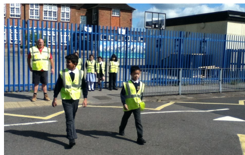
Practising crossing the road safely