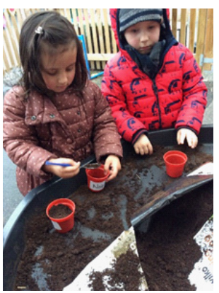
Reception - 'People and communities week'

This week, Reception have been learning about 'People who help us'. They have had some exciting visits from our local Police, a doctor and our very own lollipop lady. The children had the opportunity to try on some of the special uniform and learnt a lot about how these people help us in lots of different ways.