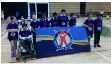
Our Panathlon Team

9 children attended the competition. There were 7