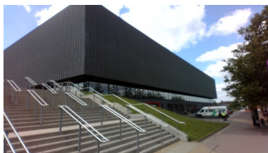
The Copperbox Arena

On Wednesday 3rd July the Panathlon team travelled to the Copper Box arena to take part in the London Youth Games finals.