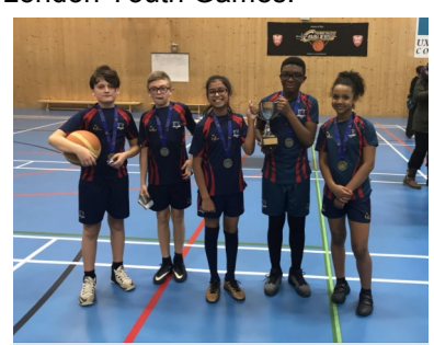
Year 6 Champions!

All of the children who competed played fantastically well and were a credit to Hillingdon Primary. The team are very excited to represent Hillingdon borough at the next London Youth Games.