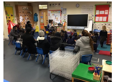
Shared learning in Reception