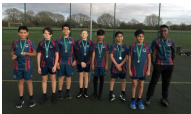
Our boys' netball team took home silver medals following a tough game in the final of the Boys Netball Tournament. Well done boys!