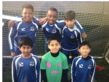
Our boys also worked hard to earn themselves a place in the quarter final of the Elms Football tournament.