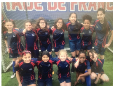
We were very proud of our girls who played really well at the Elms Football Tournament