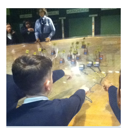
Pupils enjoyed imagining themselves as a WAAF plotter.

Year 6 also visited the museum where pupils were able to experience being a WAAF plotter, see genuine artefacts from the Battle of Britain and even try on some military uniforms!