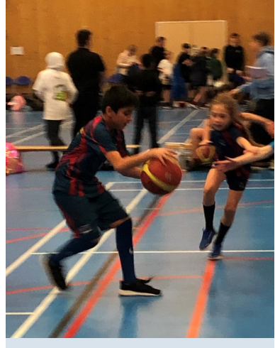
Our basketballers in action.