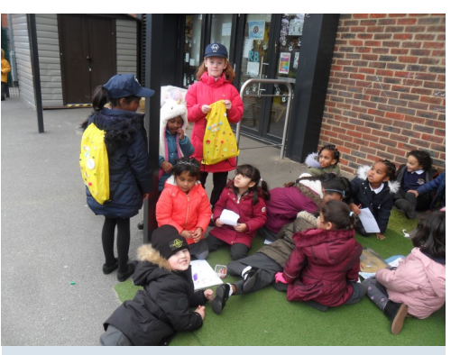
Our buddies are easily recognizable by their HPS caps and bright backpacks.

During the autumn term we discussed reinstating the buddy system. We held an assembly and then encouraged children from year 4 and 5 to apply for a position as a buddy! The response was huge! We decided to implement a two week rota so that as many children as possible could take part.