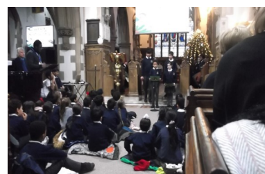
Readers at St. John's Church