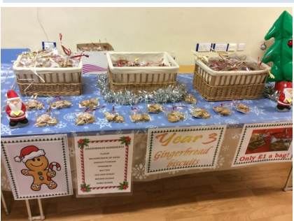
Year 3's festive gingerbread men