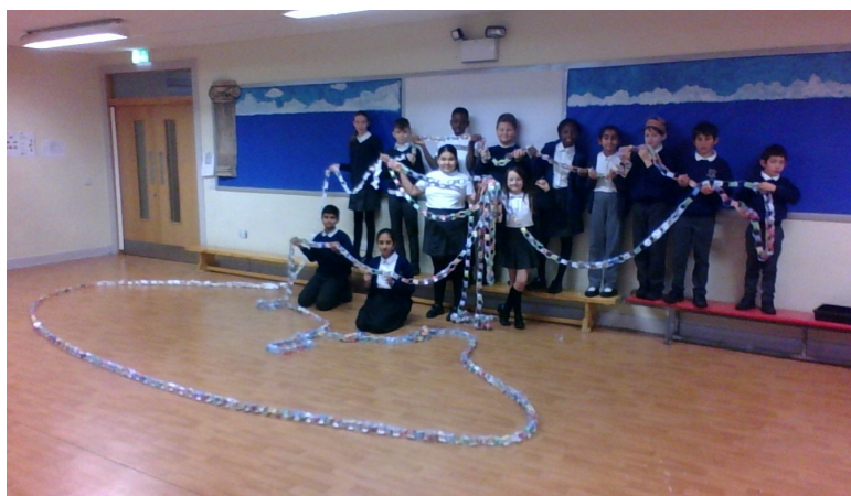
Pupils at breakfast club were getting into the holiday spirit last week as they worked together to create a huge festive paper chain!