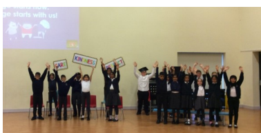
Care, Kindness and Respect