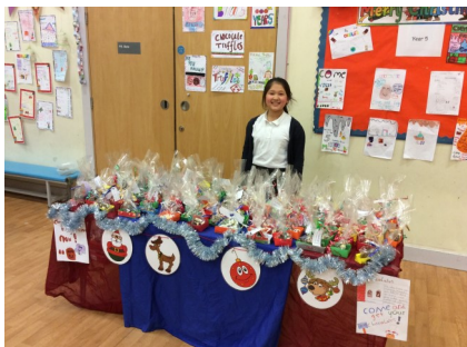
Year 5 made yummy chocolates

The Christmas Fayre was a huge success this year, raising a whopping £3,120 which will be spent on extracurricular activities to enhance pupils' learning experience. We are very grateful for the support of the school community and local businesses who kindly donated raffle prizes and chocolate for our tombola stall, and also to our staff and pupils who made items to sell and helped with the Fayre arrangements. Finally, we must say a big thank you to our parents and families who attended the Fayre and made it a wonderful community event.