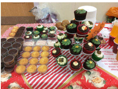
The refreshment stall was a great place to pick up a home-baked festive treat