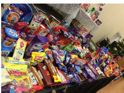
The ever-popular chocolate tombola