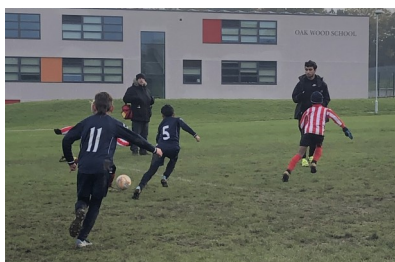
The football team in action