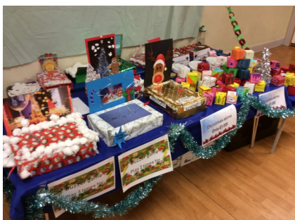
Pupils loved Year 6's slime!