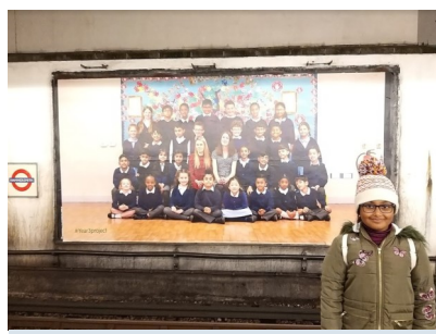
... and Hammersmith.

Lots of pupils from 4H took their parents on a trip into London to take a look at their class photograph in underground and overground stations across the