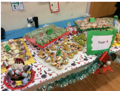
Year 4's delicious bakes