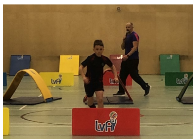
Performing at the Sports Hall Athletics competition