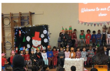
Reception singing beautifully!

On 10th December Reception performed lots of fun festive songs for their family and friends. They loved being reindeer, jingling bells and singing at the top of their voices.