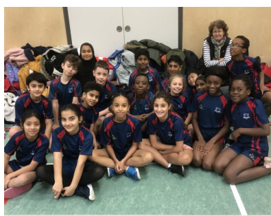
Sports Hall Athletics Team

All pupils performed fantastically and came away with some very good scores. Well done to all the team for putting in such a great effort!