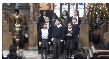
H Factor Finalists

These finalists then went on to perform solo in front of the whole school and each class had the opportunity to vote for their favourite singer to represent HPS at the concert.