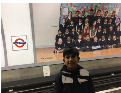
3QS / 4H Class picture at Bond Street ...

Turner Prize-winner and filmmaker Steve McQueen's billboards show class photographs of thousands of children from the capital's schools. 613 posters featuring Year 3 pupils were displayed across London's 33 boroughs to celebrate the idea of citizenship and reflect the diversity of London.