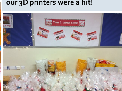
Year 2 ran a sweet stall