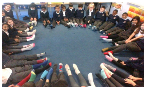
3A with their Odd Socks!

The theme for 2019's Anti-bullying Week was, 'Change starts with us.' Children celebrated the start of the week with Odd Socks Day, giving the boys and girls an opportunity to celebrate their creativity, personalities and similarities whilst also raising £302 for the Anti-bullying Alliance.